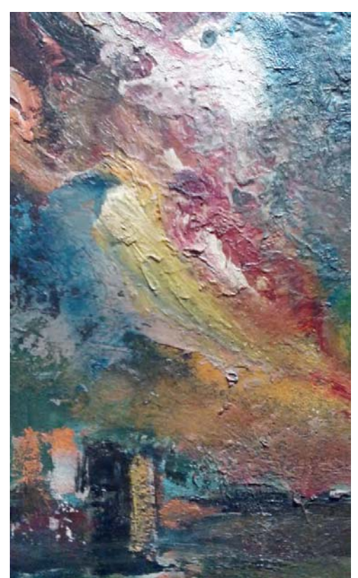
Fig. 1 – Jovan Bijelić. "Tempest over Marinko's Pond" (Oil on canvas, 1955; Courtesy of Dušan Vukićević).

Passages from Smail Tihić's <sup>7</sup> "Jovan Bijelić: life and work" are almost the only available source of the artist's wrestling with the eye disease. He was painting even when he barely percieved colors at the palette, while his friends' opinion helped him to get an impression of what he had created <sup>8</sup> (Figure 1).